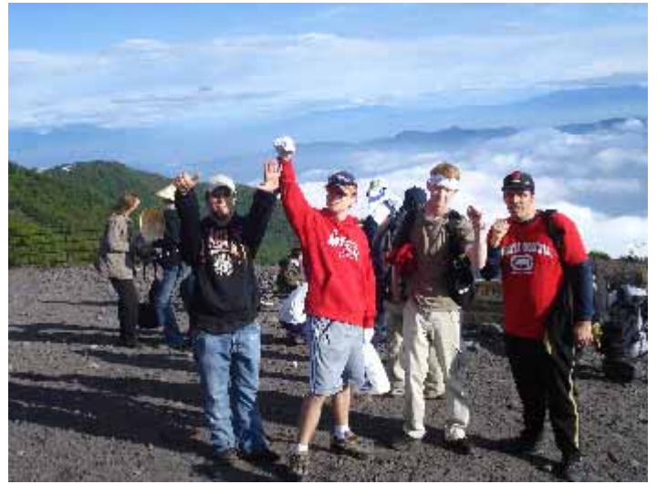
Mt. Fuji (climbing)